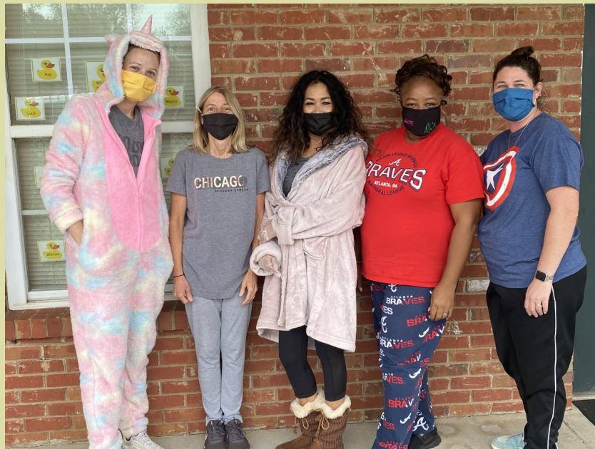
Pajama Day in PreK!

This teaching team is amazed by our current students attending both face to face and through ClassFusion. Their resiliency and progress is truly inspiring and rewarding to see.